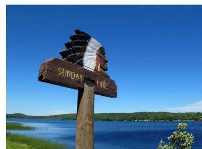
Minutes from beautiful Sunday Lake